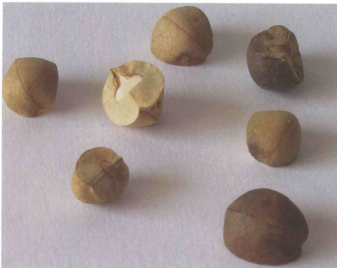
An array of Mexican jumping beans, showing the interior hollows created by developing larvae.

Perhaps part of this is attributable to the fact that just as contemporary artists have, since the 1960s, increasingly deployed objects and rehearsed scenarios that are in some fundamental sense extra-artistic – without their own inherent aesthetic surplus – so too does Cabinet, in engaging with artifacts and information that originate outside the world of art, find that the most useful location for the creative gesture lies in the discursive (literary) space that surrounds them. If such moves to some extent act to distort or destabilize the conventional informational landscape one expects to find in material from history, the sciences etc , they also have what seems to us enormous potential to capture certain aspects of experience – things that are happening in the texture of everyday life that don't traditionally rise to the level of the official record, and are in fact already the purview of the literary gesture. If these experiments allow for a greater degree of indeterminacy than is usually associated with such ostensibly empirical fields of endeavour, we feel that they also provide a more inviting way into the material: preparing the ground, as it were, for an ethics of curiosity and concern that encourages readers to learn more than on their own.