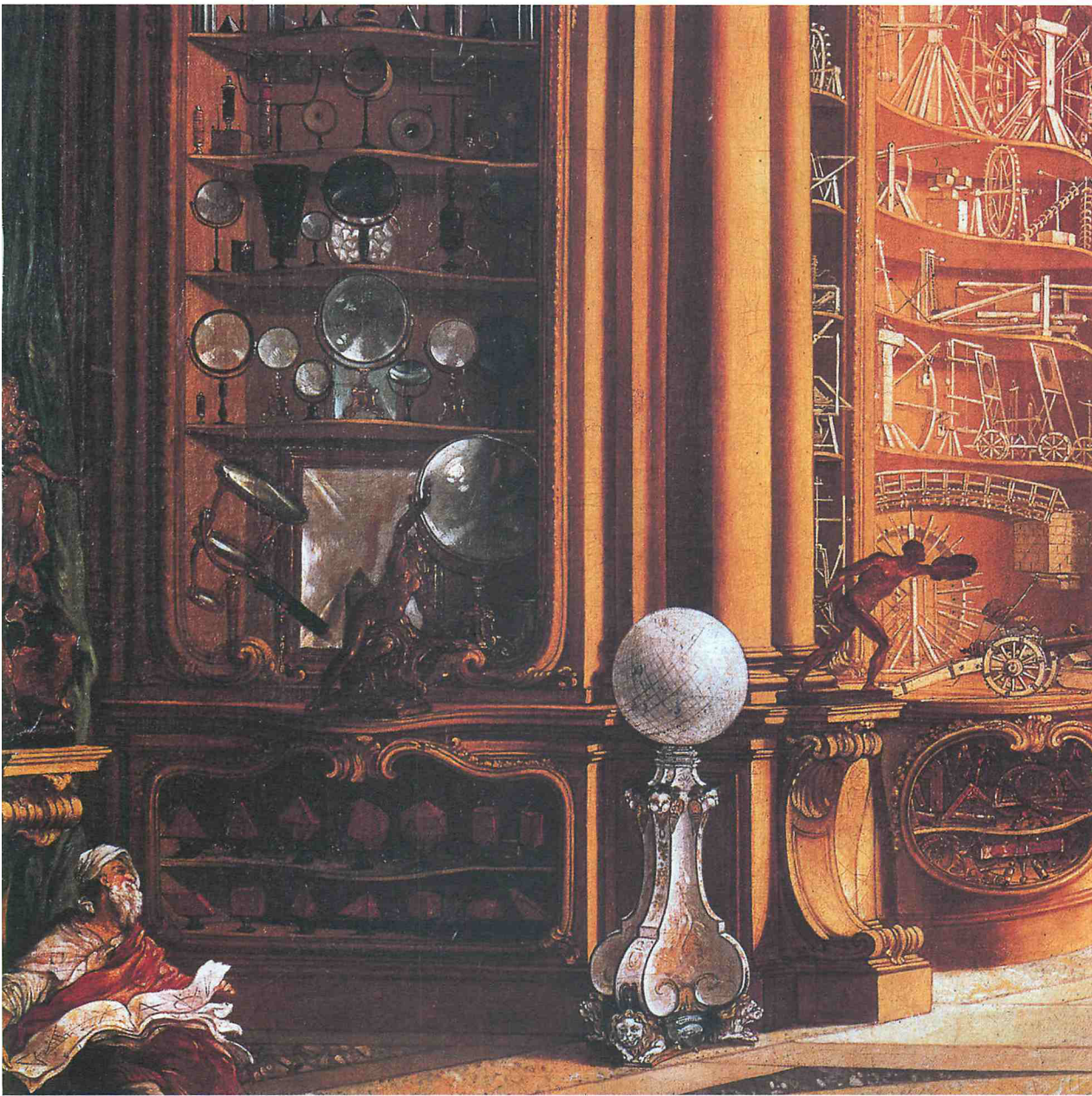
Detail from door overhead by Jacques de Lajoüe. A painter of fantastic architectures, Lajoüe made four such overheads for the Cabinet Bonnier in 1734, this one being above the right-hand door of the room housing the Second Cabinet of Natural History.